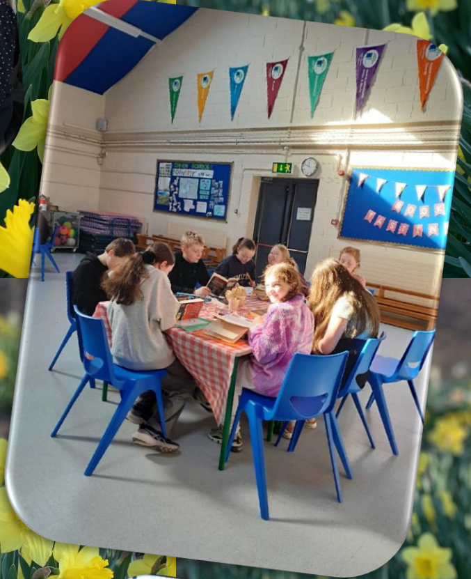
Book Tasting Restaurant